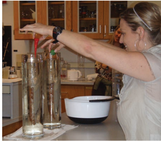
Figure 2. A facilitator preparing to drop two distinct "phytoplankton" into highly viscous karo syrup to investigate how their shapes affect sinking rate.

syrup to simulate a low Reynolds number environment (as the ocean feels to plankton), students were challenged to experiment with their groups' various shapes and their orientation to record the fastest and slowest possible sinking rates. A worksheet was provided for students to record times and draw their phytoplankton, encouraging them to note properties that controlled sinking rates. Once students figured out the fastest shape in their group, they were able to choose from pre-made shapes that were specifically designed to have slow or fast sinking rates. However, before picking these shapes, they were asked to justify their selection based on prior observations. After recording results from this next round of tests, students wrote down the factors controlling sinking in highly viscous fluids on their worksheet. At the end of the inquiry, facilitators held a "sink-off" (Figure 2) of the fastest and slowest shapes to serve as a backdrop to discuss important content related to the activity.